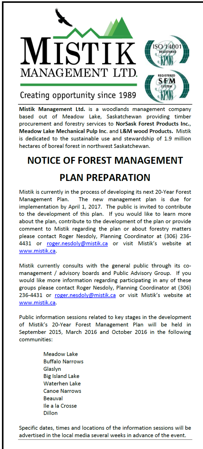
Figure 2. Periodic notice of Mistik's 2017-2027 FMP development process and public engagement sessions